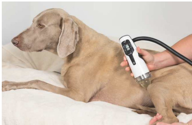
Focused shock wave therapy: knee osteoarthritis