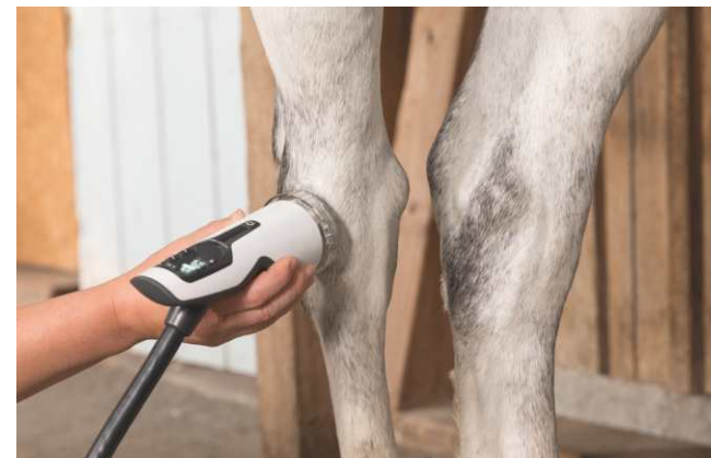
Focused shock wave therapy: osteoarthritis (bone spavin)