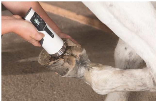
Focused shock wave therapy: podotrochlosis