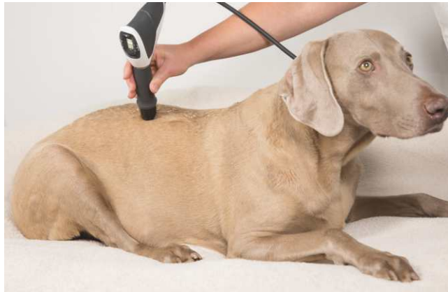
Radial pressure wave therapy: trigger point treatment