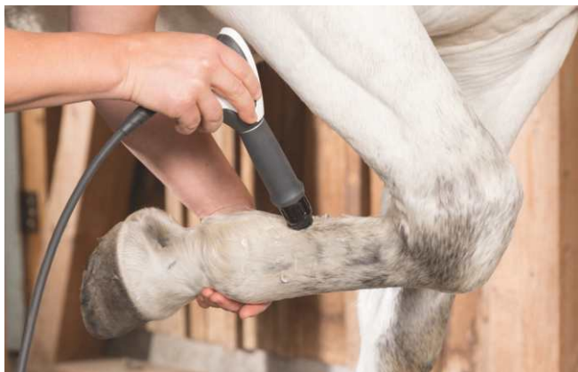
Radial pressure wave therapy: tendinopathy