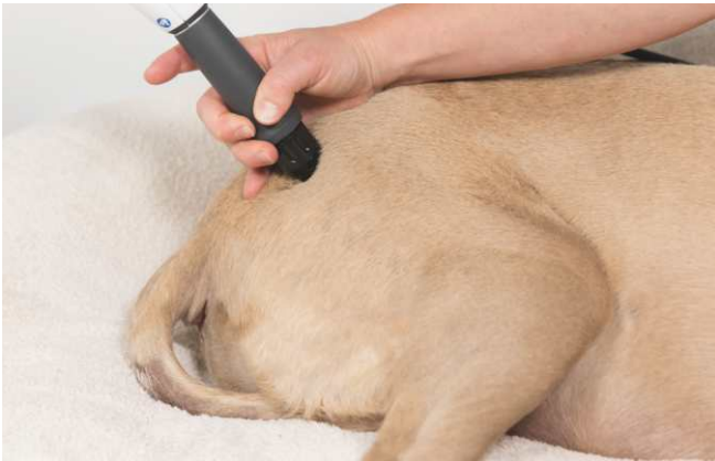
Radial pressure wave therapy: hip dysplasia