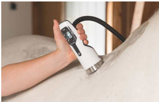
Focused shock wave therapy: kissing spines