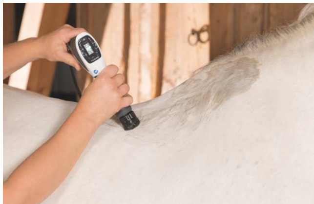
Radial pressure wave therapy: trigger point treatment