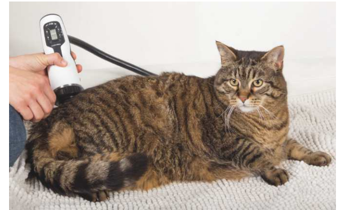
Focused shock wave therapy: cauda equina syndrome