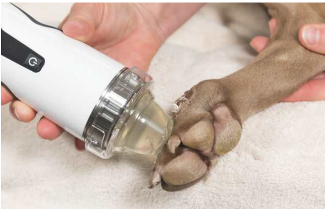
Focused shock wave therapy: metatarsal stress fracture