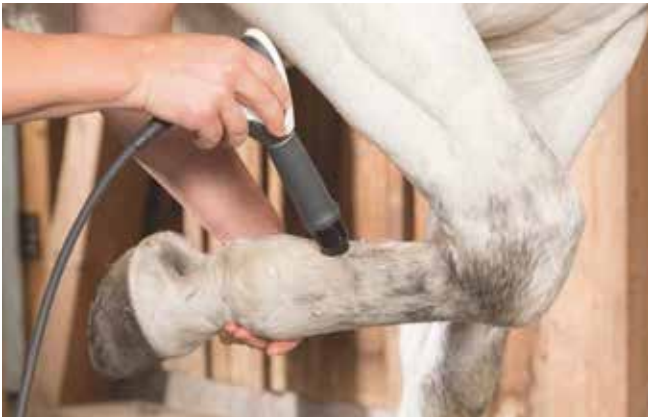
Radial pressure wave therapy: tendinopathy