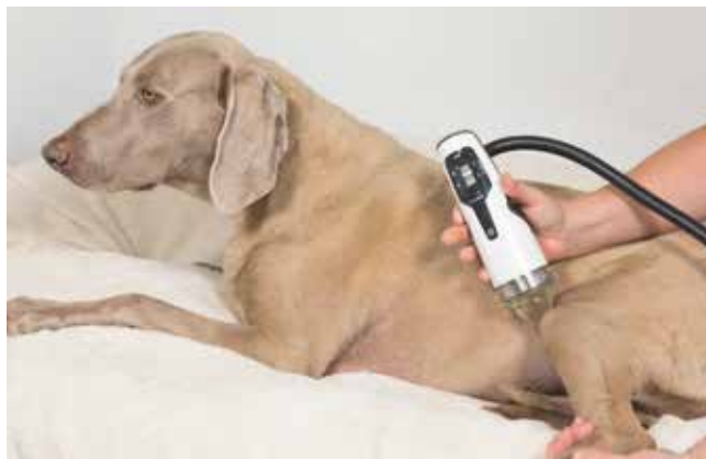
Focused shock wave therapy: knee osteoarthritis