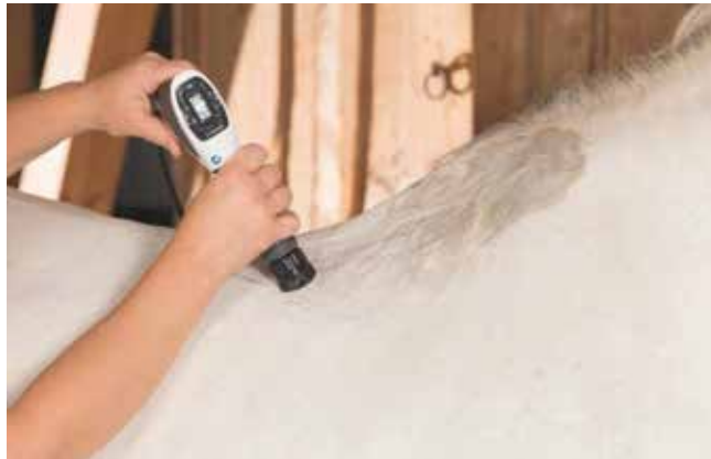
Radial pressure wave therapy: trigger point treatment