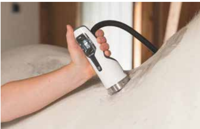
Focused shock wave therapy: kissing spines