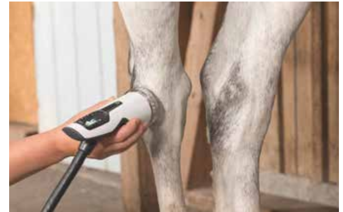
Focused shock wave therapy: osteoarthritis (bone spavin)