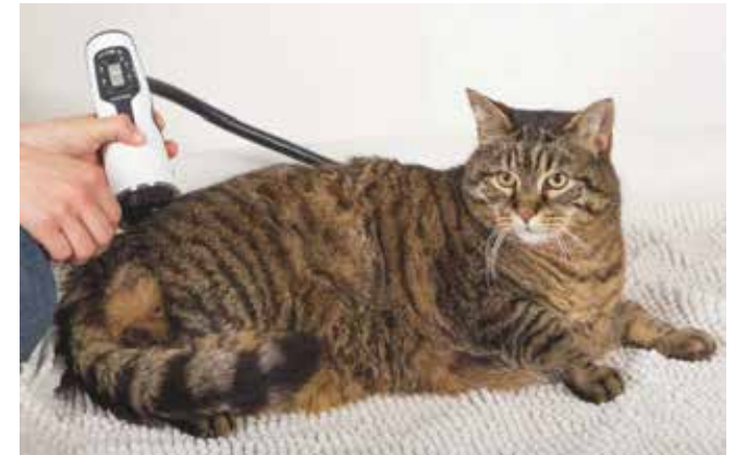
Focused shock wave therapy: cauda equina syndrome