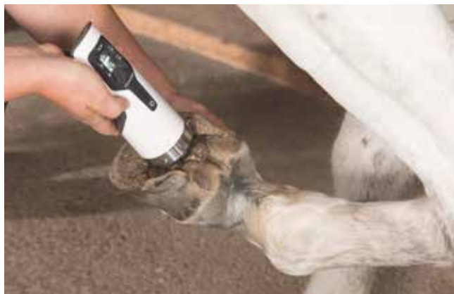
Focused shock wave therapy: podotrochlosis