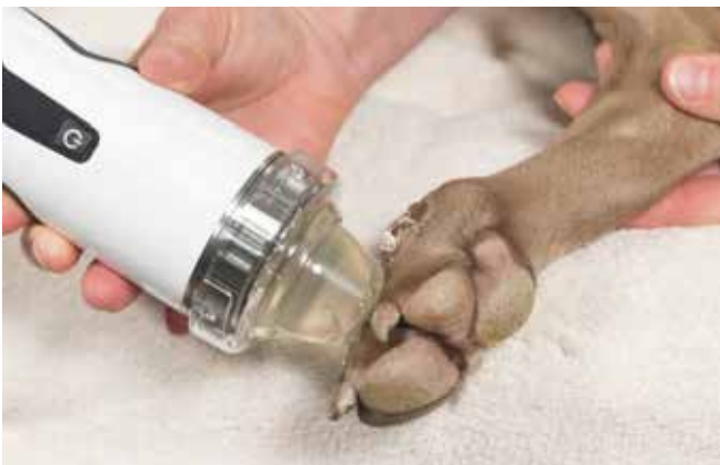
Focused shock wave therapy: metatarsal stress fracture