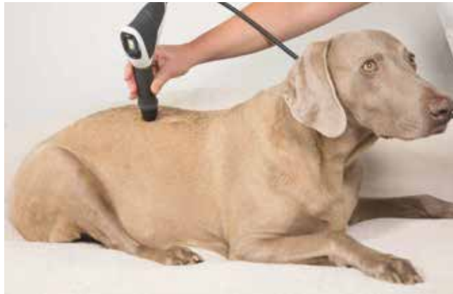
Radial pressure wave therapy: trigger point treatment