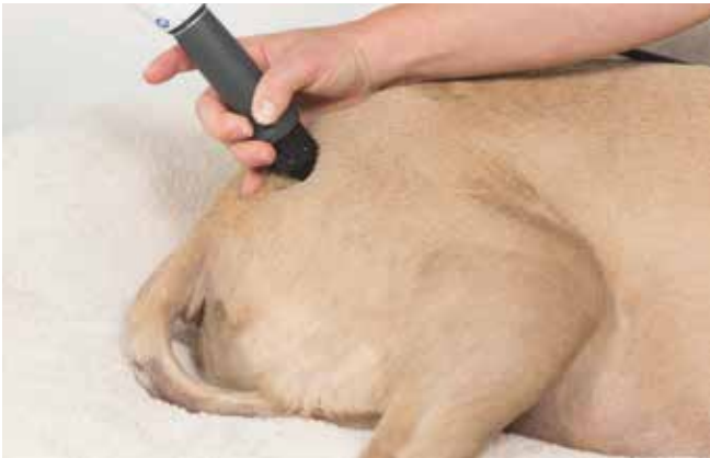
Radial pressure wave therapy: hip dysplasia