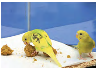
Budgies forage through Bird Bread for familiar food (seed).