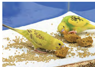
Portions of Bird Bread is eaten during this process.