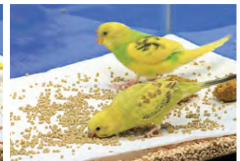
Budgies become familiarized with Harrison's and readily eat High Potency Fine nuggets. Gradually discontinue seed.