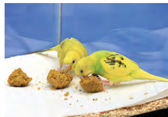
Budgies acquire flavor for Bird Bread, and subsequently nuggets (Bird Bread is made of ground Harrison's nuggets).