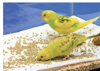
Budgies become familiarized with Harrison's and readily eat High Potency Fine nuggets. Gradually discontinue seed.