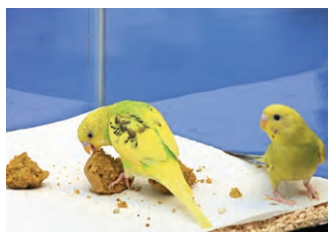
Budgies forage through Bird Bread for familiar food (seed).