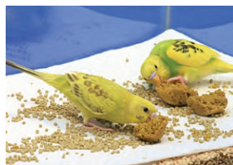
Portions of Bird Bread is eaten during this process.