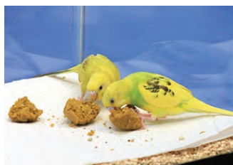
Budgies acquire flavor for Bird Bread, and subsequently nuggets (Bird Bread is made of ground Harrison's nuggets).